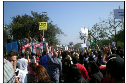
AIDS Walk Los Angeles

The biggest change this year—and one of the main reasons for SBFHC's participation—was the addition of much-needed follow-up care for patients. All the clinics affiliated with the Southside Coalition of Community Health Centers, including SBFHC, provided free follow-up appointments for patients seen during the CareNow clinic. The Southside Coalition set up a system to coordinate the referral of patients to the most appropriate clinic based on