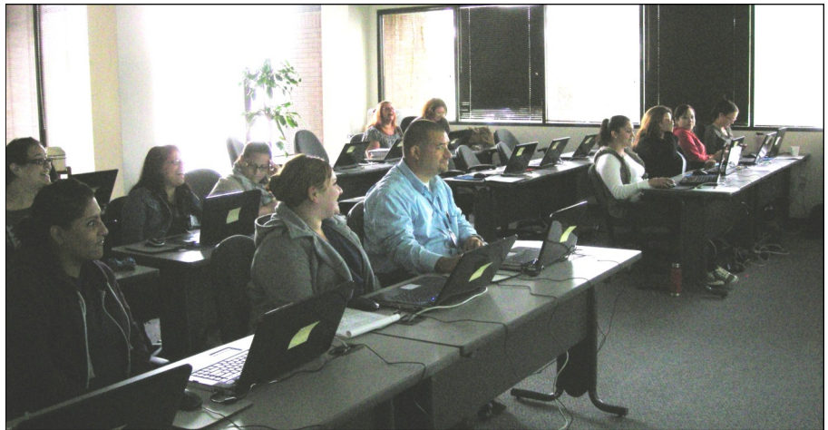
SBFHC staff members from Inglewood and Gardena receive NextGen training in preparation for those two clinics going live with electronic health records in October